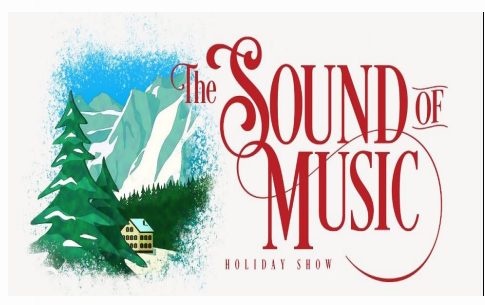
We will drive to the theater where we can see the play.

We are going to see a play called, "The Sound of Music"