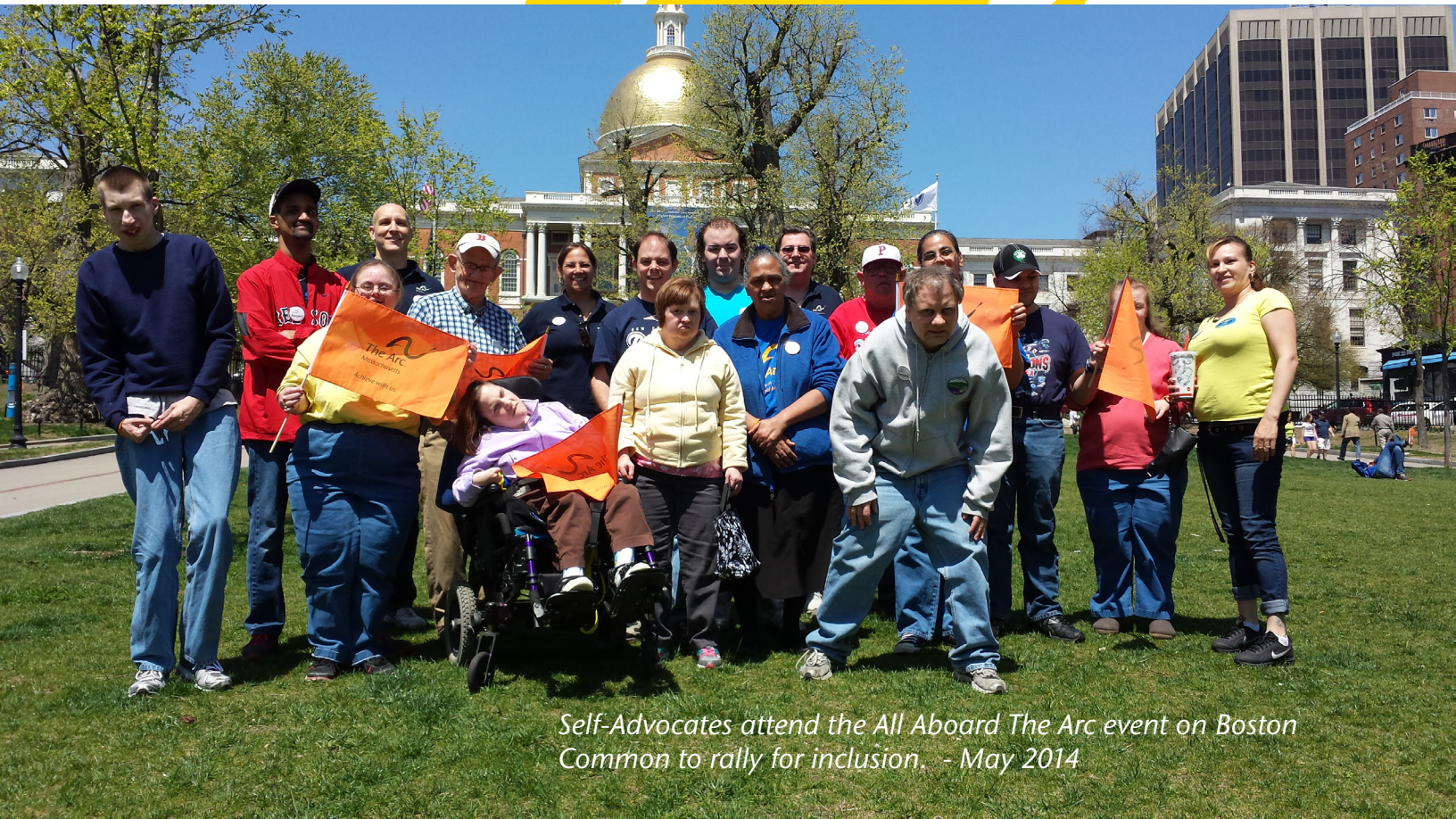
Self-Advocates attend the All Aboard The Arc event on Boston Common to rally for inclusion. - May 2014